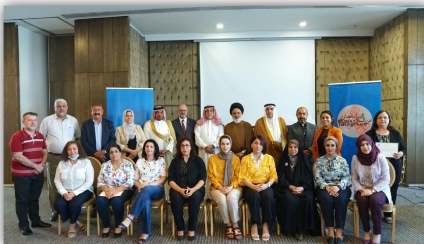
From the workshop with tribal and religious leaders and women

The Women Talking Peace project continued to work on involving women in peacebuilding and state-building processes in Iraq. We can report on the following activities: