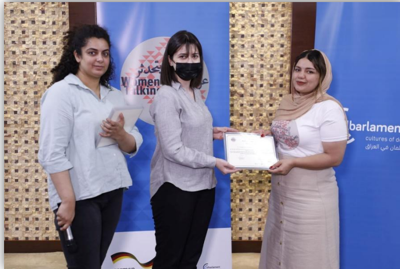
One of the participants in the leadership programme receives her diploma during the graduation ceremony