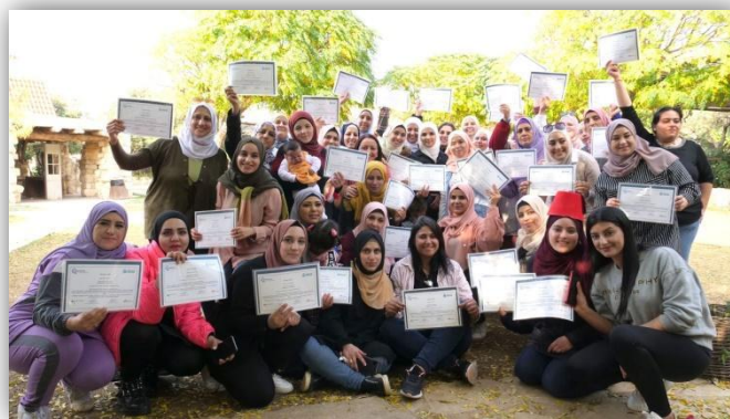
Graduates of the programme in Lebanon, November 2021

The Women Take The Lead project continued to build the leadership capacity of a mixed group of Lebanese women and female refugees. Some of the activities implemented in 2021 are presented below: