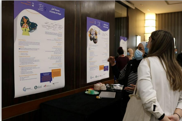
One of the women behind the initiative 'A smile of hope' explains the concept behind it, November 2021