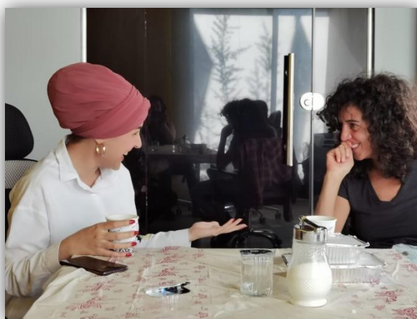
Participants talk during one of the workshops. Networking is a big part of all of elbarlament's projects