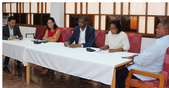
Photo: UN Women / Cape Verde - UNWOMEN Workshop at the Parliament on Parity law, 2018

Improving the participation of women means that those in power - usually men - lose (part of) that power. It is therefore important to win allies for the bill and to promote it in advance. 89