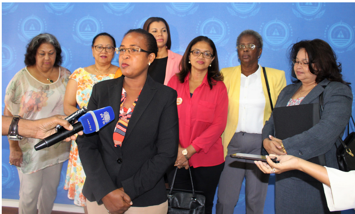
Women elected members advocating for the parity law, Cape Verde

Legislators, governments, experts on legal drafting, and Civil Society Organizations across the WCA region will find guidance in this document. This will include information on how to assess the chances of successful application of quota laws in different contexts and which TSM may be applied in different constitutional and electoral settings. Summary for good legislative practice can be found at the end of the legal guide.